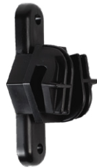
Insulator for wire and rope