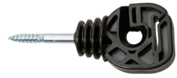
Insulator for tape