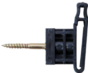
Insulator 3 in 1