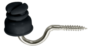
Insulator for angle