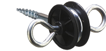
Insulator anchoring handle